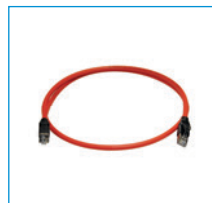
Adapter Frequency inverter