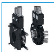
Robot change unit